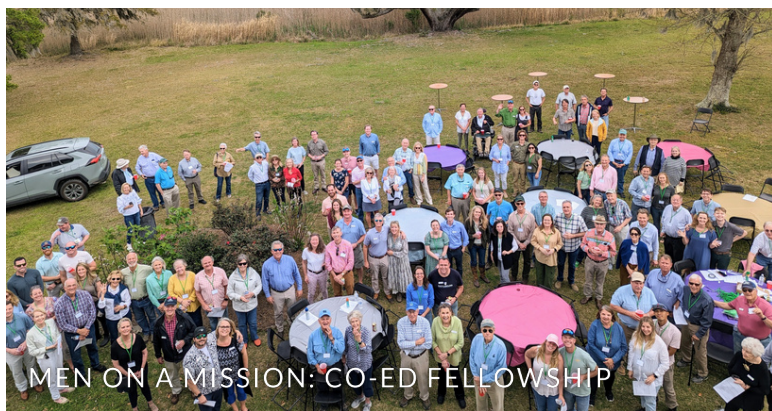
MEN ON A MISSION: CO-ED FELLOWSHIP