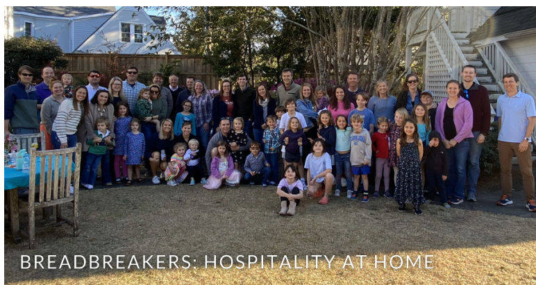
BREADBREAKERS: HOSPITALITY AT HOME