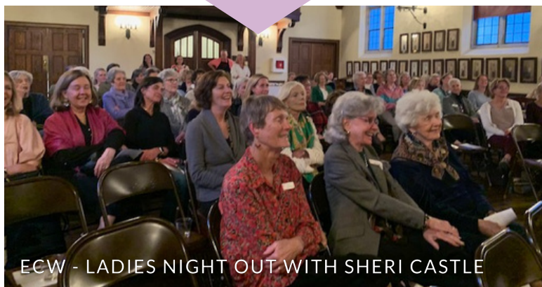
ECW - LADIES NIGHT OUT WITH SHERI CASTLE