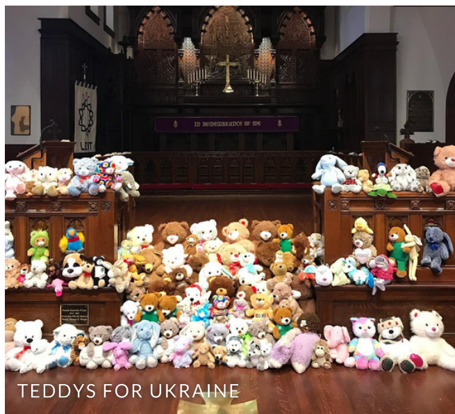
TEDDYS FOR UKRAINE