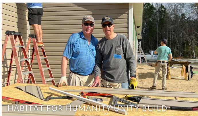
HABITAT FOR HUMANITY UNITY BUILD