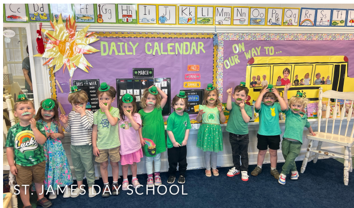
ST. JAMES DAY SCHOOL