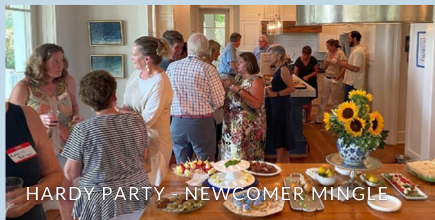
HARDY PARTY - NEWCOMER MINGLE