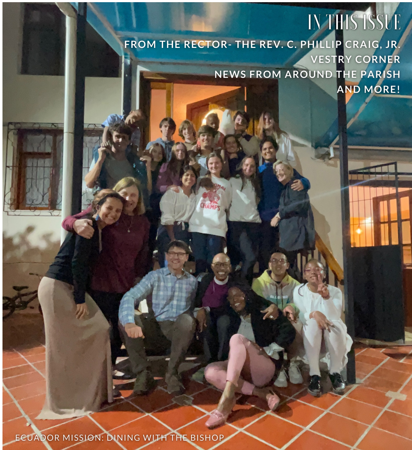
ECUADOR MISSION: DINING WITH THE BISHOP