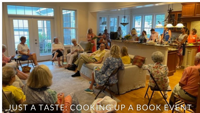
JUST A TASTE: COOKING UP A BOOK EVENT

Thank you again for helping us create this unique cookbook that helps bring everyone to the table!