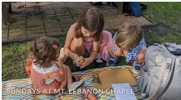
SUNDAYS AT MT. LEBANON CHAPEL