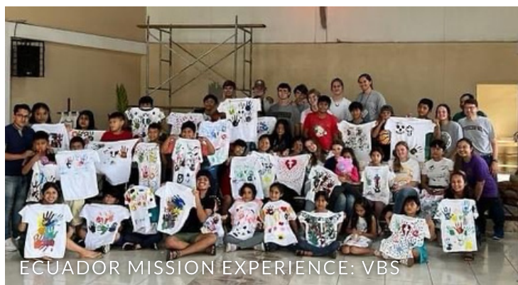
ECUADOR MISSION EXPERIENCE: VBS