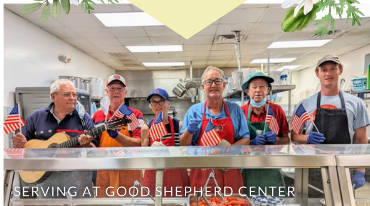
SERVING AT GOOD SHEPHERD CENTER