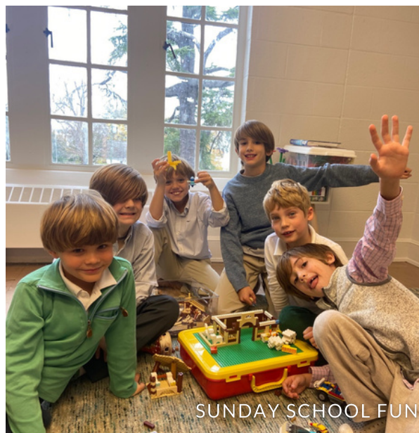
SUNDAY SCHOOL FUN