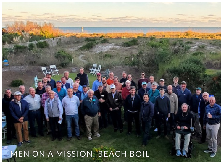
MEN ON A MISSION: BEACH BOIL