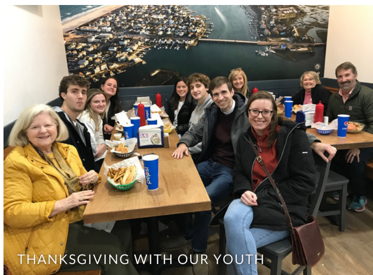
THANKSGIVING WITH OUR YOUTH