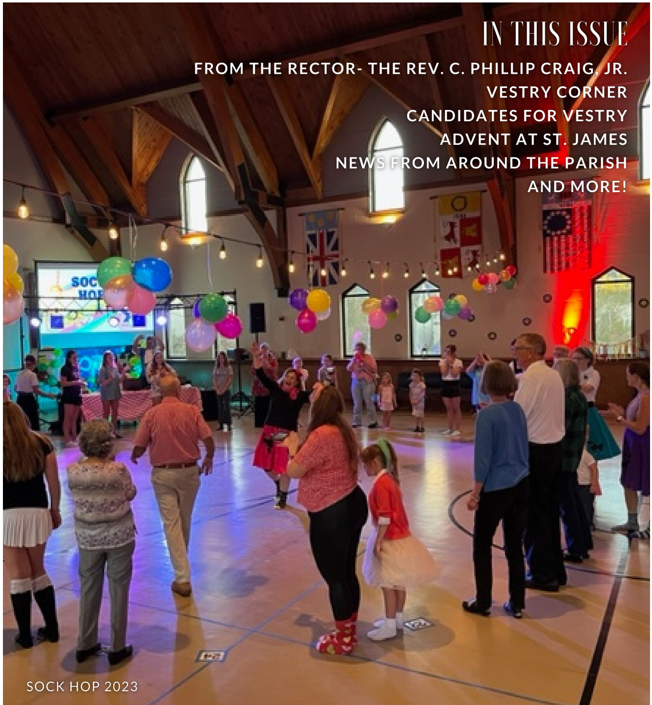
SOCK HOP 2023