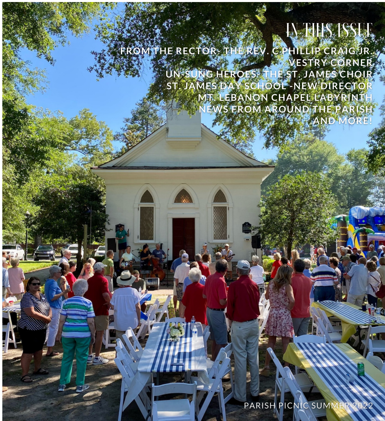
PARISH PICNIC SUMMER 2022