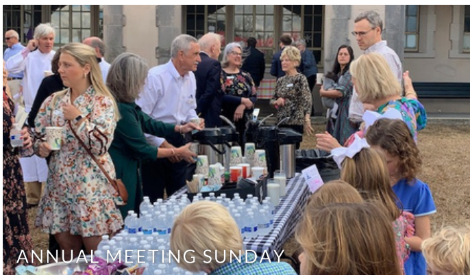
ANNUAL MEETING SUNDAY