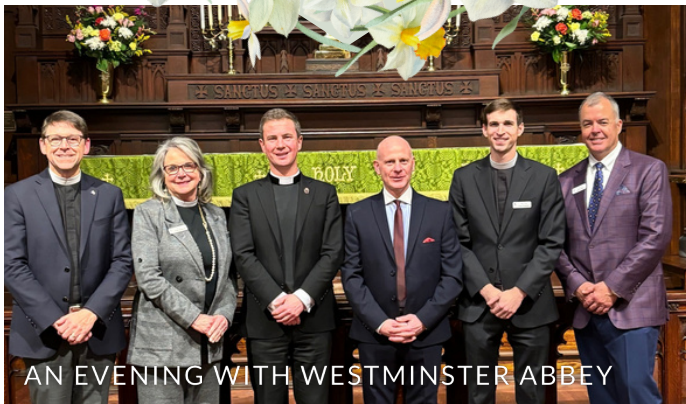
AN EVENING WITH WESTMINSTER ABBEY