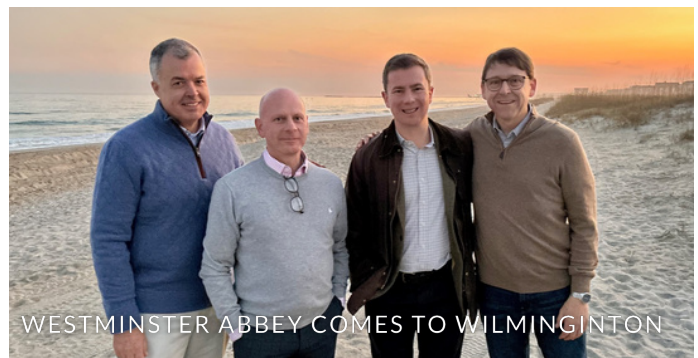
WESTMINSTER ABBEY COMES TO WILMINGTON