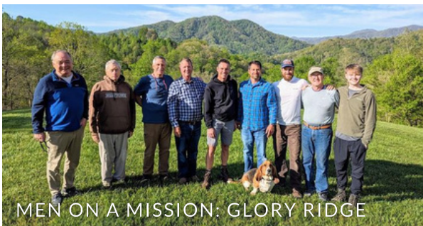
MEN ON A MISSION: GLORY RIDGE

Come join us for the Daily Office of Morning Prayer! Each weekday on Zoom with gather for a time of prayer and fellowship. If you would like a direct link sent to your email each morning, please reach out to communications@stjamesp.org .