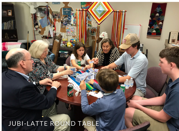
JUBI-LATTE ROUND TABLE