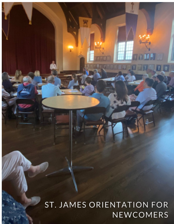
ST. JAMES ORIENTATION FOR NEWCOMERS