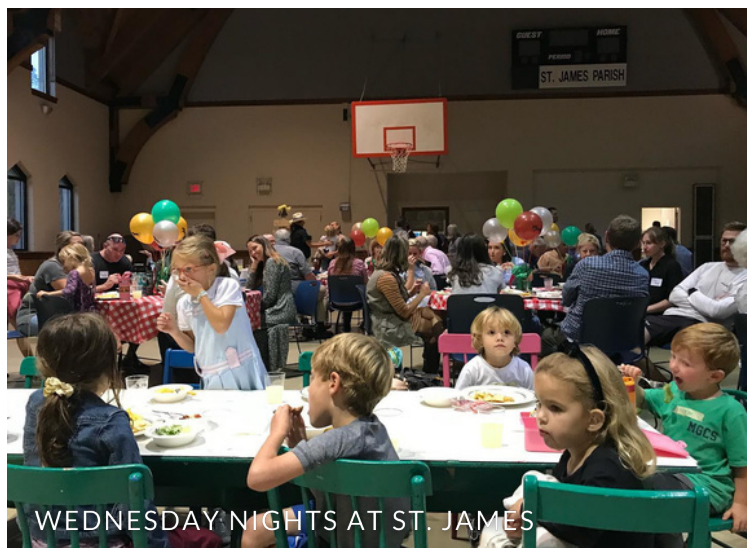
WEDNESDAY NIGHTS AT ST. JAMES