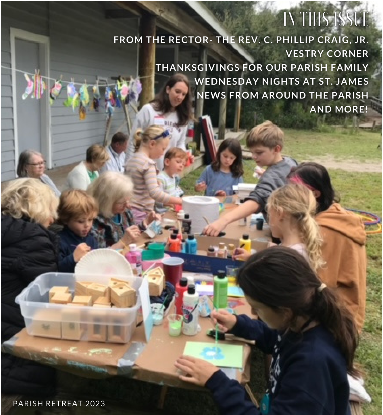
PARISH RETREAT 2023