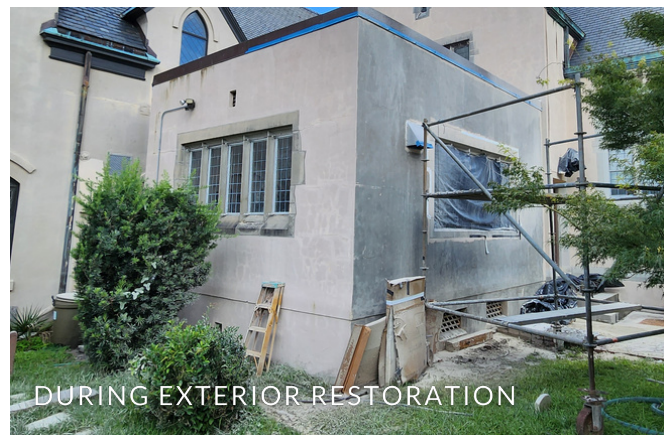
DURING EXTERIOR RESTORATION