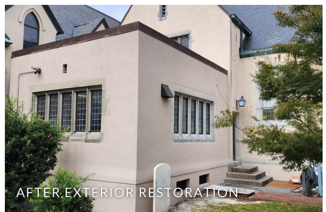
AFTER EXTERIOR RESTORATION