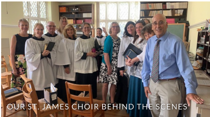
OUR ST. JAMES CHOIR BEHIND THE SCENES