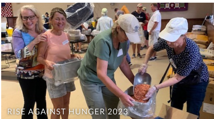
RISE AGAINST HUNGER 2023