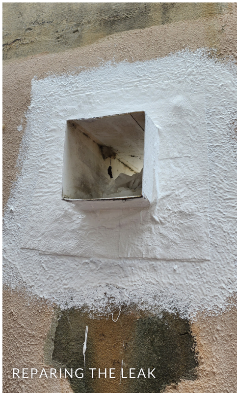
REPAIRING THE LEAK