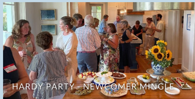
HARDY PARTY - NEWCOMER MINGLE