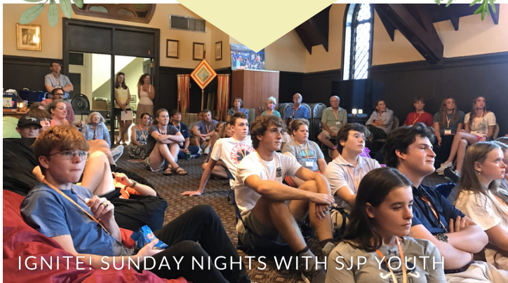
IGNITE! SUNDAY NIGHTS WITH SJP YOUTH