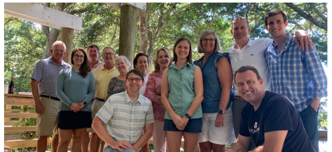
VESTRY RETREAT 2022