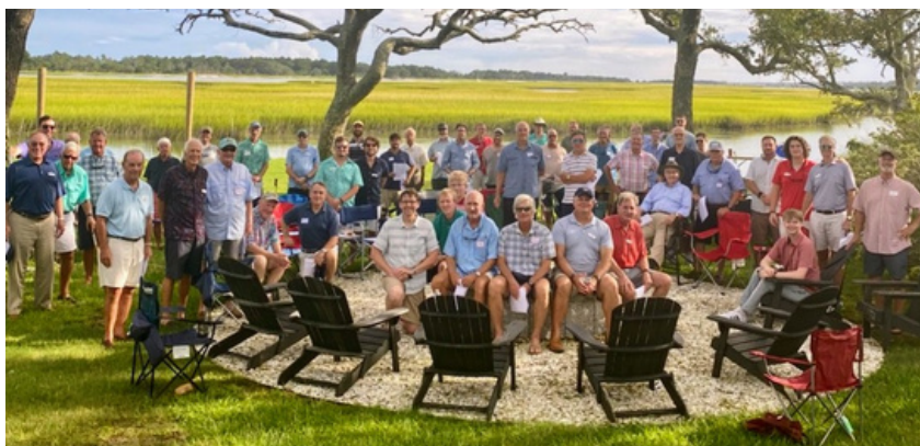
MEN ON A MISSION: BBQ ON THE ICW 2022