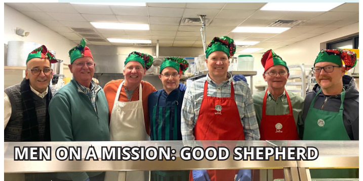
MEN ON A MISSION: GOOD SHEPHERD